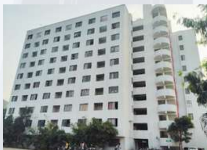
Hostel (Girl's & Boy's)