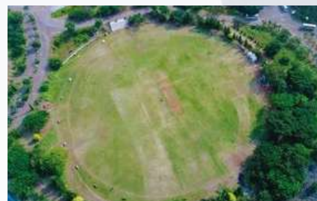
Spacious Ground Facilities