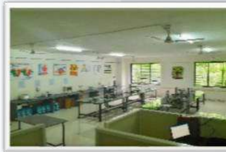
Well equipped Labs