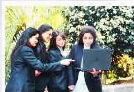
Free WiFi zone