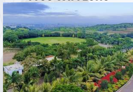
Beautiful Green Nature Campus