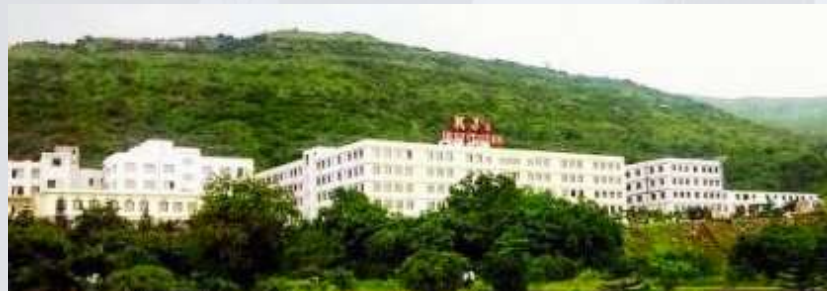
130 Acre Campus Area