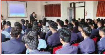
Seminar on Personality Development year - 2023