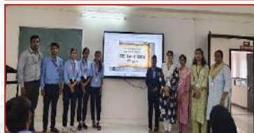
Marthi Bhasha Din 2024