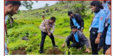
Tree Plantation 2024