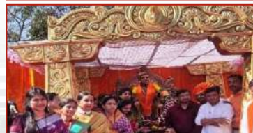
Shivajayanti Sohala 2024