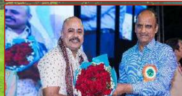
Celebrity at Cultural Event