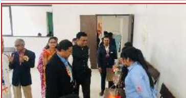
Pharma Tech Event 2024