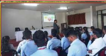
Industrial Expert seminar 2024