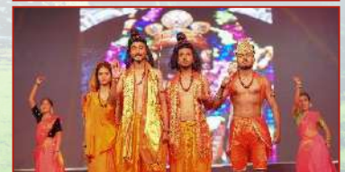
Malhal Cultural Mega Event2024