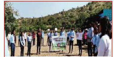
Aids day year 2023