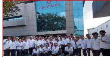
Industrial Visit Glenmark 2024