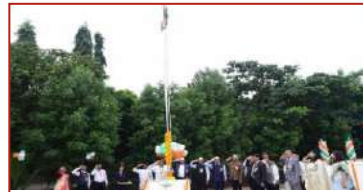
Independence Day Celebration 2023