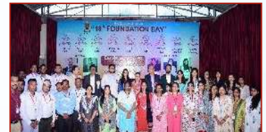
Foundation Day Celebration 2024