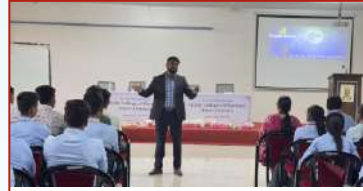
Seminar on Business Development 2024