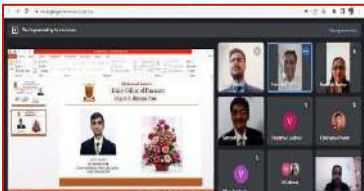
Online Seminar on Pharma startup 2024