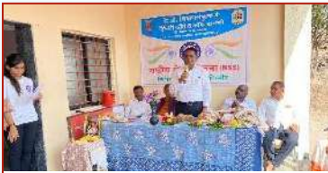
NSS Camp 2024