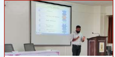
Seminar on G-PAT Exam Preparation 2024