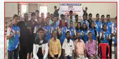
Trinity Pharmacy Students DBATU Divisional Sport Selection 2024