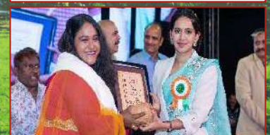
Celebrity at Cultural Event