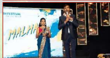
Malhal Cultural Mega Event2024