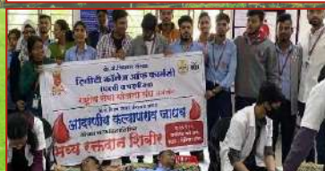
Blood Donation Camp 2024