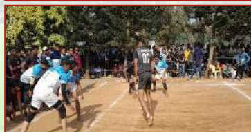
Maidan Event 2024