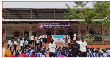
NSS Social Activity at Bopgaon school 2024