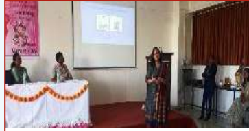
women empowerment year - 2023