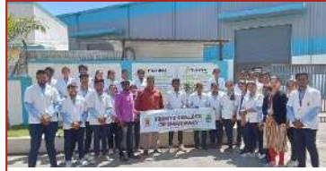
Industrial Visit Pharmanext year 2023