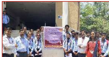
Preplacement Training 2024