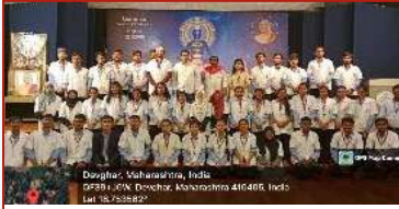
Devghar Visit year 2023