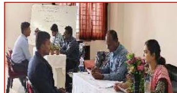
Campus Interview Drive 2024