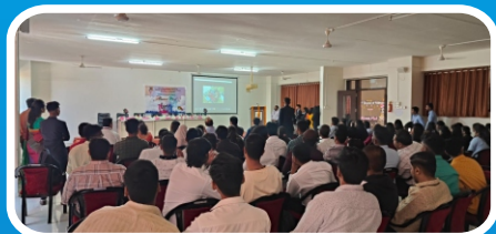
Alumni Meet 2023