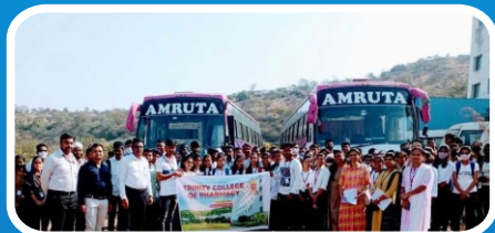
Industrial Educational Visit at Kolhapur