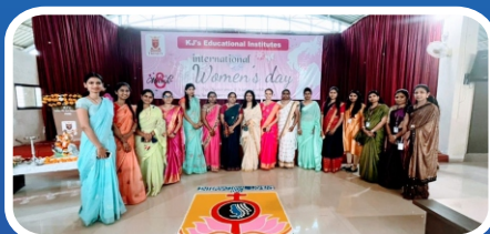
Women's Day Celebration