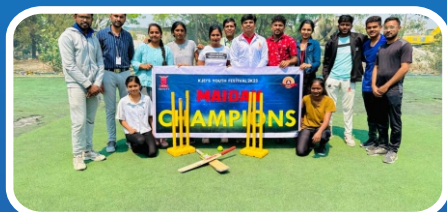
KJ Maidan Sports Event