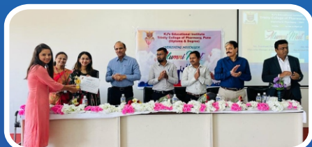
TCOP Toppers batch