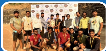
TCOP State Level Champion