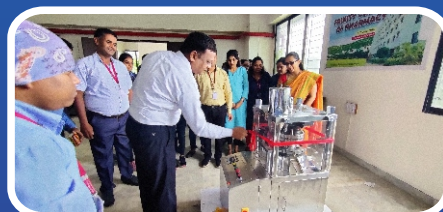
Workshop On Instruments Handling