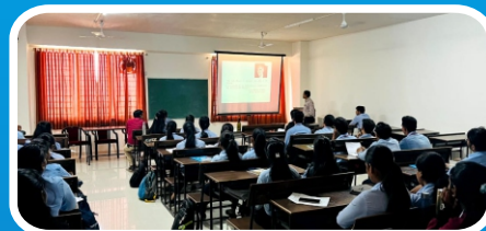
Guest lecture on Competitive Exam