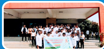
Science Park Visit