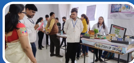
State Level Competition at TCOP