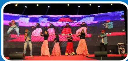
Malhar Youth Festival