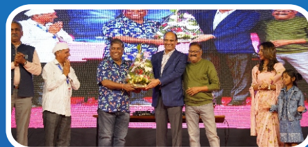
State Level Competition at TCOP