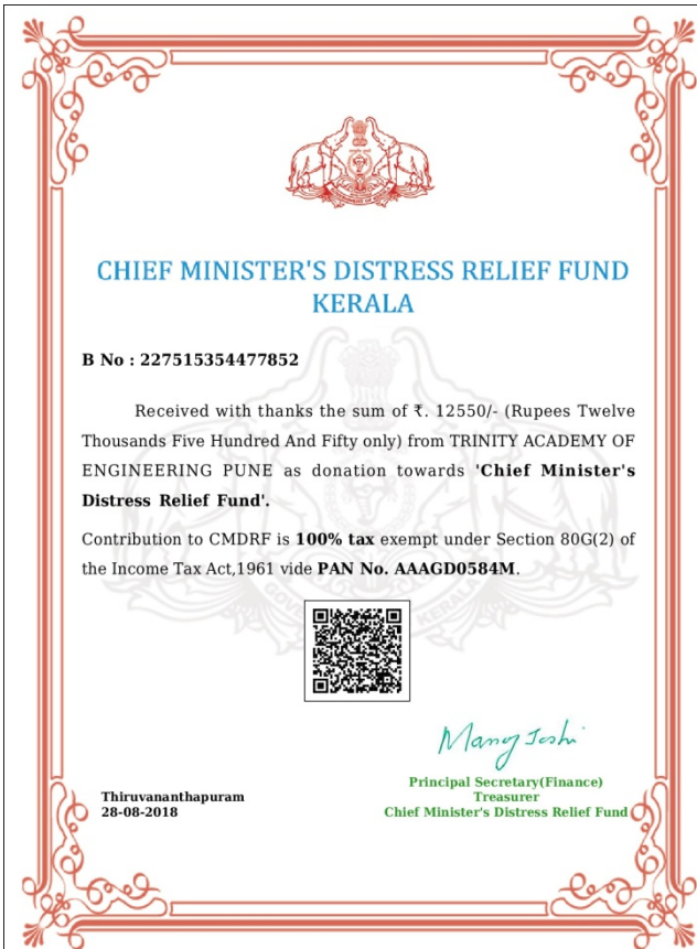
Certificate of Payment