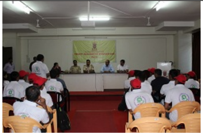
Students asking queries related to field management.