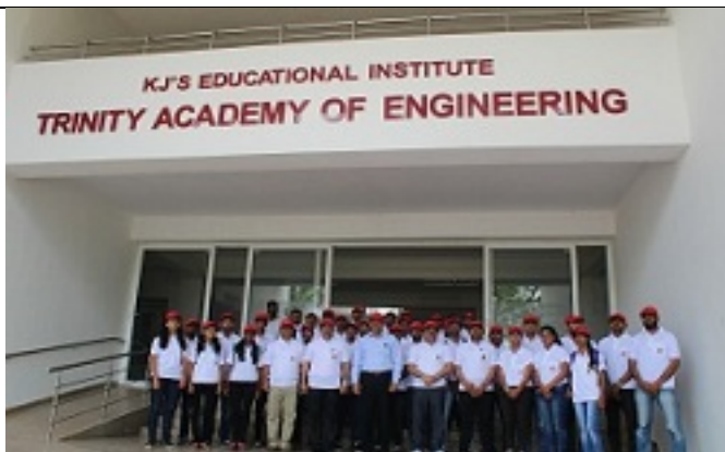
CSR team at TAE