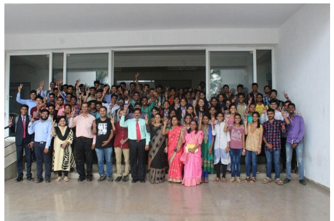
Students with guest, Principal TAE and Faculty Coordinator