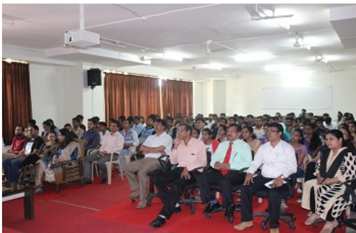
Staff, Guest & Students attending the session