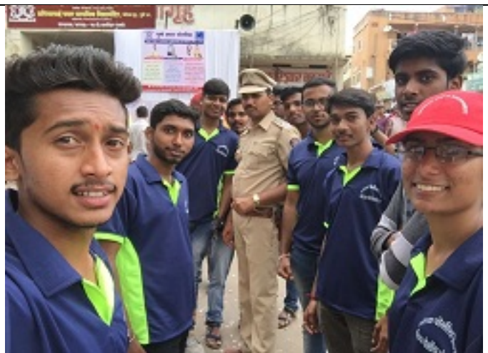
CSR team at actual site.