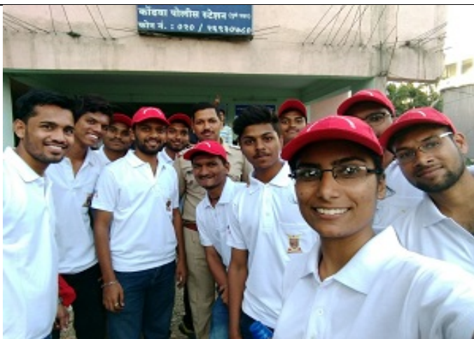
CSR team at Kondhwa police station.