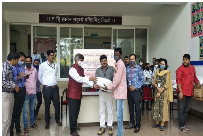
Principal (TAE) , T&P Coordinator & HOD (Civil) Distributing Ration Kits To KJEI Students