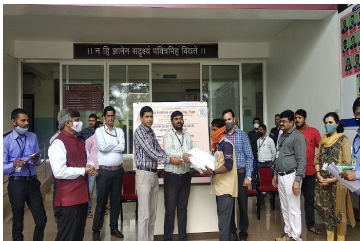
OS & CSR Head Distributing Ration Kits To KJEI Employee