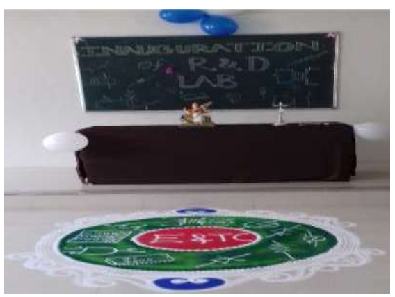
R&D Lab E&TC